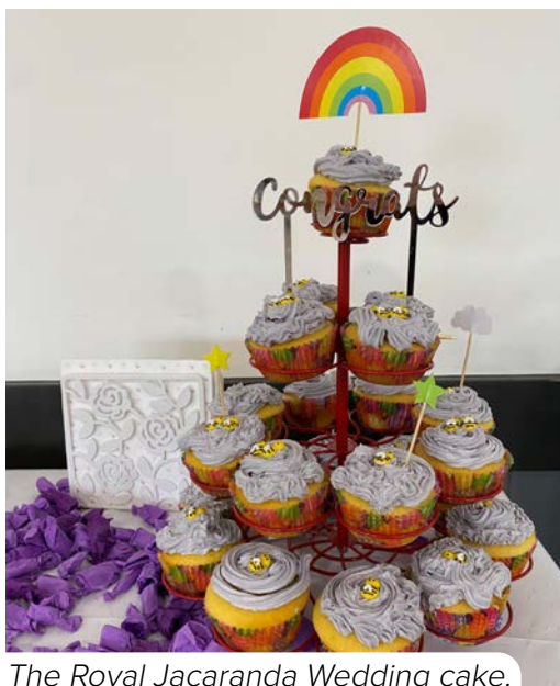
The Royal Jacaranda Wedding cake.