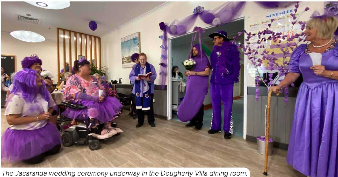
The Jacaranda wedding ceremony underway in the Dougherty Villa dining room.