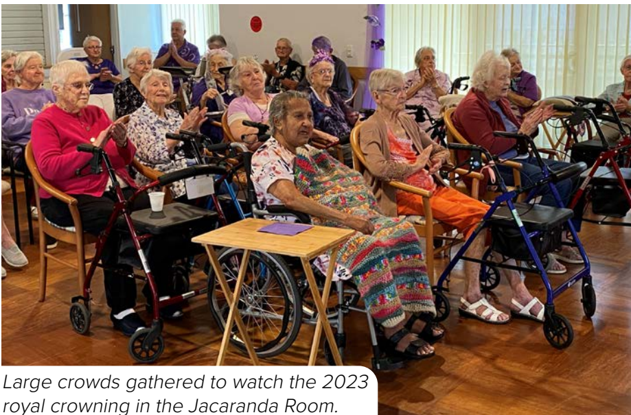
Large crowds gathered to watch the 2023 royal crowning in the Jacaranda Room.