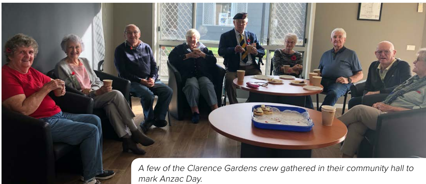
A few of the Clarence Gardens crew gathered in their community hall to mark Anzac Day.