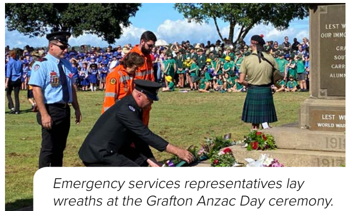
Emergency services representatives lay wreaths at the Grafton Anzac Day ceremony.