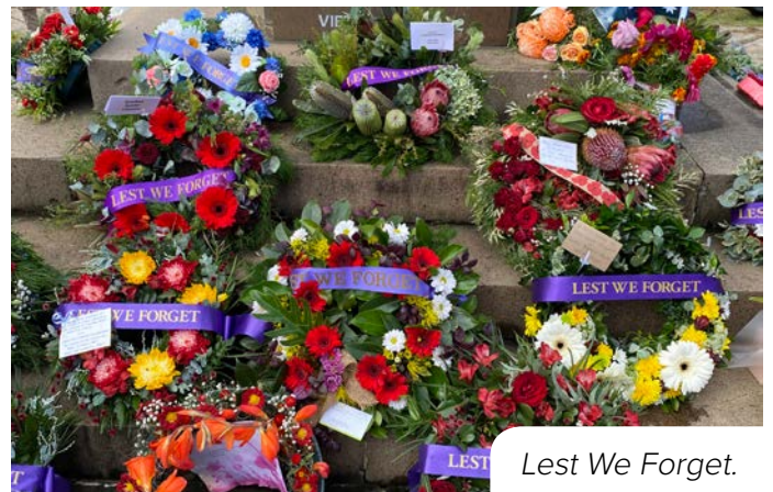
Lest We Forget.