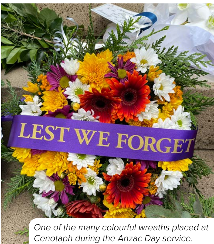
One of the many colourful wreaths placed at Cenotaph during the Anzac Day service.