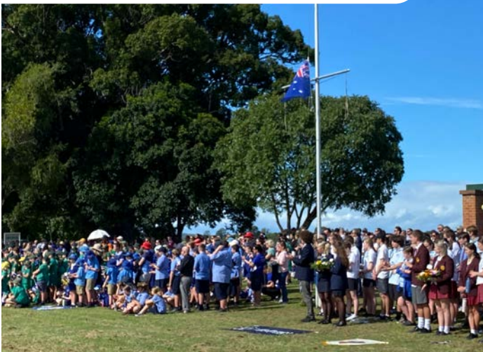
School children gather at Memorial Park in Grafton for the Anzac Day service.

Wreaths were laid and The Last Post sounded as an airforce jet plane performed a fly-over to mark the occasion.