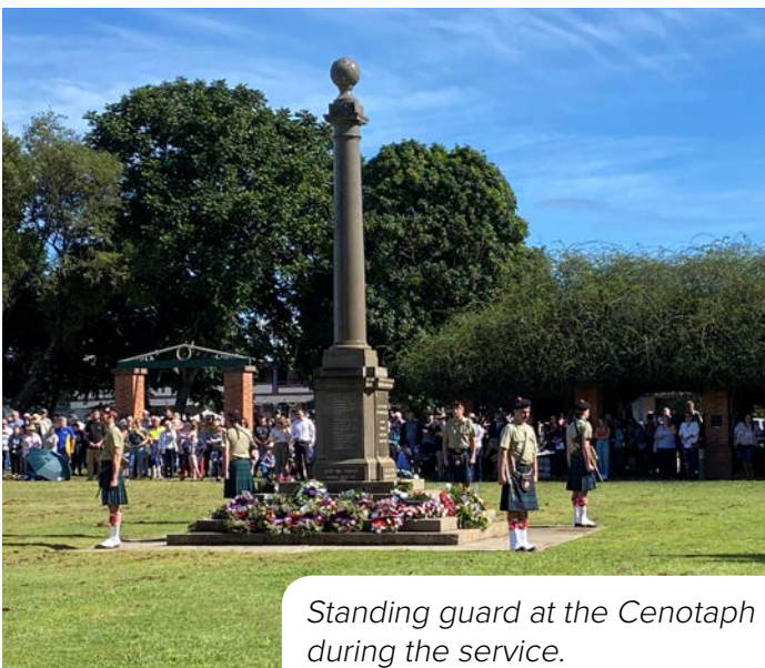
Standing guard at the Cenotaph during the service.