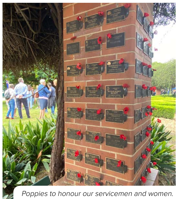
Poppies to honour our servicemen and women.