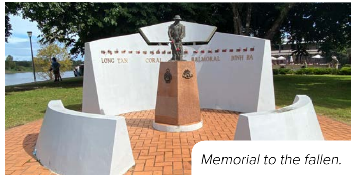
Memorial to the fallen.