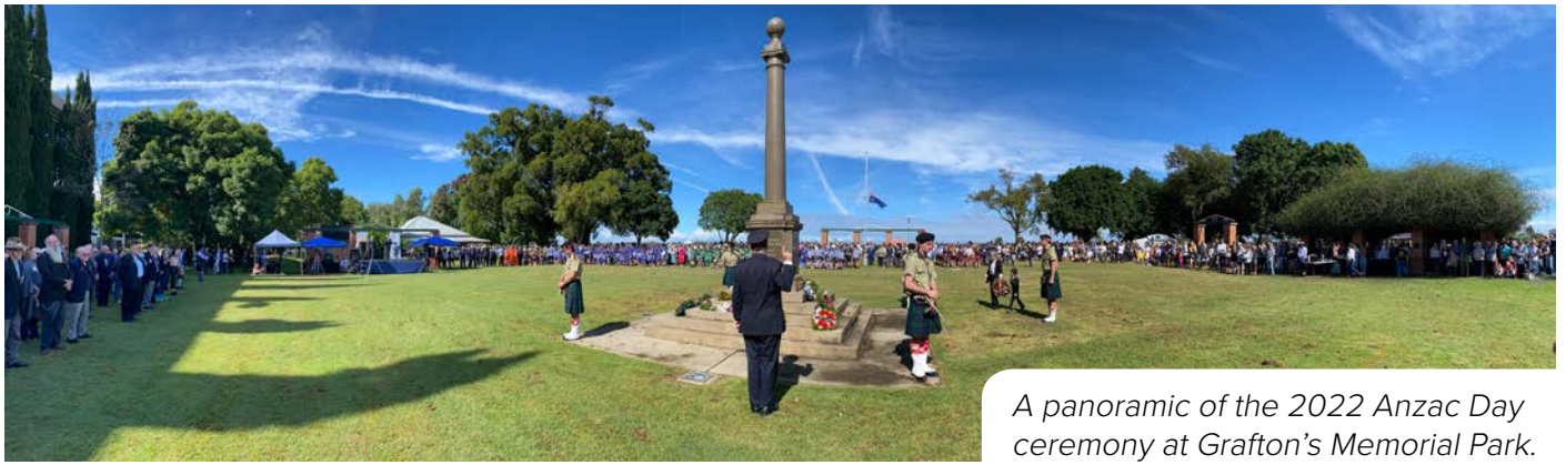
A panoramic of the 2022 Anzac Day ceremony at Grafton's Memorial Park.