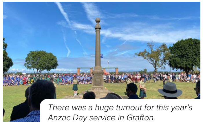
There was a huge turnout for this year's Anzac Day service in Grafton.