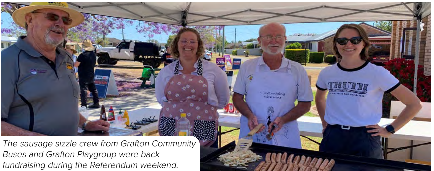
The sausage sizzle crew from Grafton Community Buses and Grafton Playgroup were back fundraising during the Referendum weekend.

Referendum weekend in October raising more than $400 to share between the two organisations.