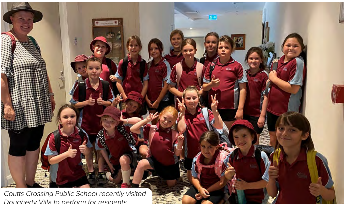
Coutts Crossing Public School recently visited Dougherty Villa to perform for residents.