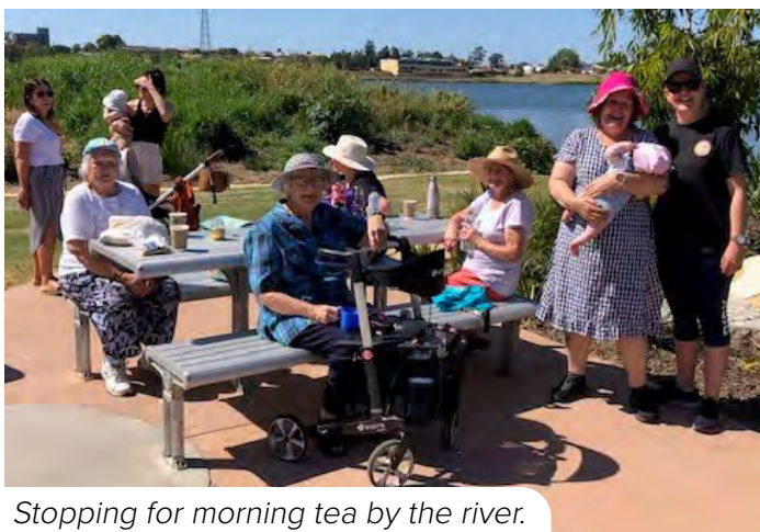
Stopping for morning tea by the river.