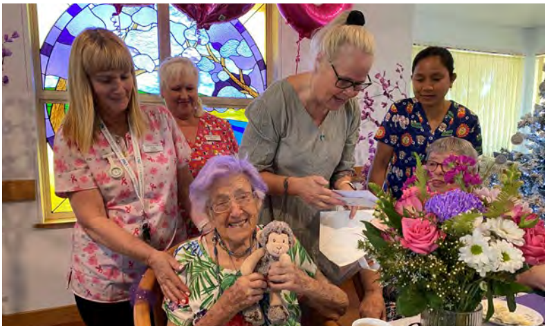
Who's a cheeky monkey? Dougherty Villa staff are the gifts that keep on giving for our oldest resident.