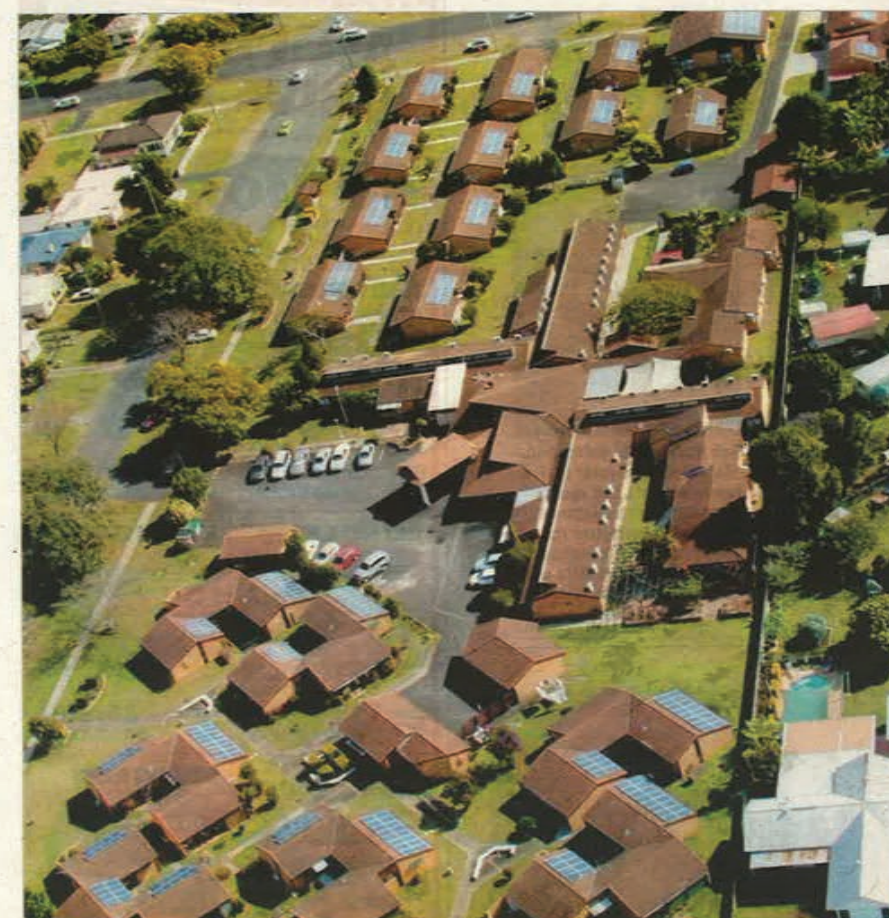
SUN WORSHIPPERS: All 72 independent living units of Clarence Village have been fitted with solar electricity generating systems.